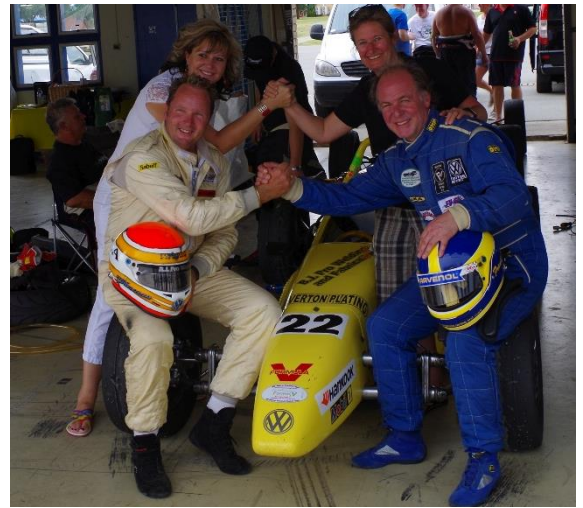
2013 in Zwartkops and Phakisa